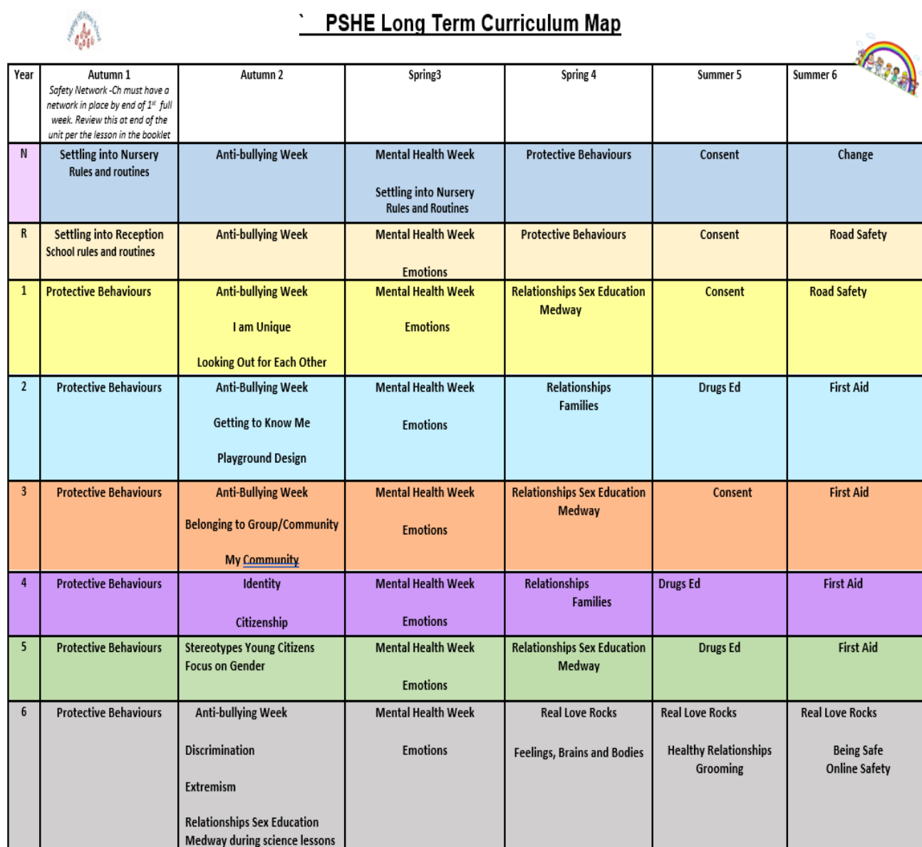
Fig 1 Overview Long term Curriculum Map